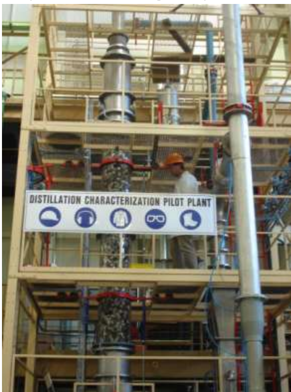
One of the distillation columns in the Department that facilitates cutting-edge research in separation technology in the chemical industry.

The Department of Process Engineering offers the Bachelor of Engineering Degree in Chemical Engineering with electives in mineral processing.