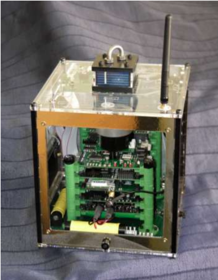
Edu_Satellite is an educational satellite that is used by the Department of Electrical and Electronic Engineering in the postgraduate Satellite Systems coursework.

From 2010, the programme Electrical and Electronic Engineering with Computer Science is replaced by, and further expanded, by the Informatics specialisation.