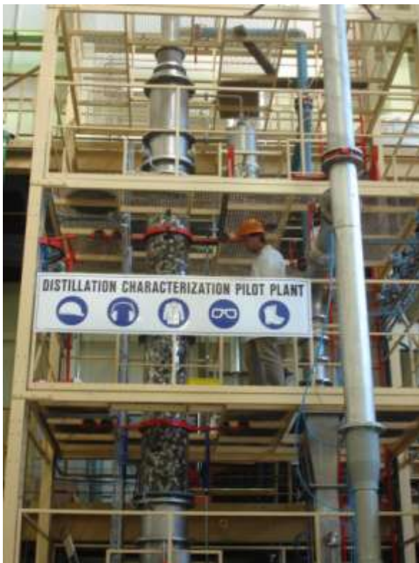
One of the distillation columns in the Department that facilitates cutting-edge research in separation technology in the chemical industry.

The Department of Process Engineering offers the Bachelor of Engineering Degree in Chemical Engineering with electives in mineral processing.