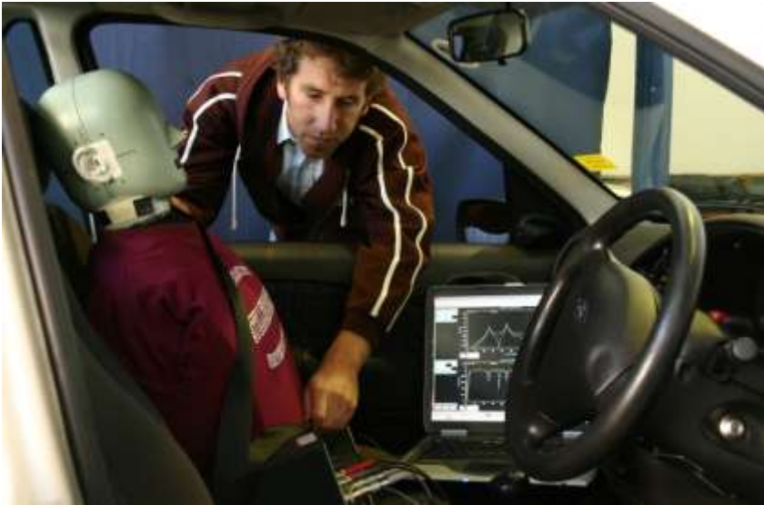
An experimental investigation of noise management in a motor vehicle employs various specialist areas of Mechanical and Mechatronic Engineering.